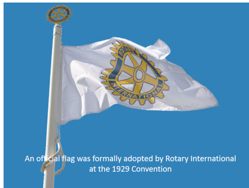
An official flag was formally adopted by Rotary International at the 1929 Convention

An official flag was formally adopted by Rotary International at the 1929 Convention in Dallas, Texas. The Rotary flag consists of a white field with the official wheel emblem emblazoned in gold in the center of the field. The four depressed spaces on the rim of the Rotary wheel are colored royal blue. The words "Rotary" and "International" printed at the top and bottom depressions on the wheel rim are also gold. The shaft in the hub and the key way of the wheel are white. The first official Rotary flag reportedly was flown in Kansas City Missouri, in January 1915. In 1922 a small Rotary flag was carried over the South Pole by Admiral Richard Byrd, a member of the Winchester, Virginia Rotary Club. Four years later, the admiral carried a Rotary flag in his expedition to the North Pole. Some Rotary clubs use the official Rotary flag as a banner at club meetings. In these instances it is appropriate to print the words "Rotary Club" above the wheel symbol, and the name of the city, state or nation below the emblem. The Rotary flag is always prominently displayed at the World Headquarters as well as at all conventions and official events of Rotary International.