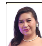
Soci Ame Patagani-Viking Community Service